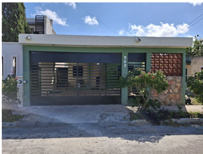
A new meeting place for Villa Magna