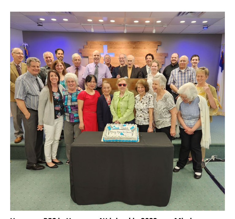
Harmony BFC in Harmony NJ joined in 2023 as a Mission Church. The Church Extension Director walked with them as they formed their first elder board with their existing leadership. The congregation has appreciated the help in filling their pulpit with men from the BFC while they are looking for a pastor, a process the Church Extension Director is also helping with.