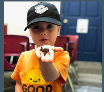
The kids have been learning and making friends at co-op